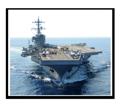
USS George H. W. Bush (CVN 77)

Commissioned March 12, 1914, USS Texas (BB 35) served for more than 34 years, participating in World War I and World War II. She is one of only eight remaining U.S. Navy battleships and the country's oldest surviving battleship. She has been maintained as a memorial at San Jacinto State Park since she was decommissioned in 1948.